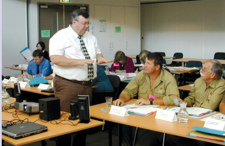
Crime prevention workshop facilitated by criminologist Timothy D Crowe MS.

Good CPTED makes people not only safer, but also more confident as they move around the community and enjoy its amenities. It is an effective, inexpensive and long lasting crime reduction strategy.