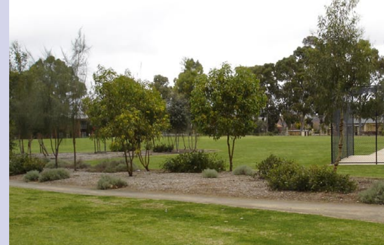
Caption re: planting and screening