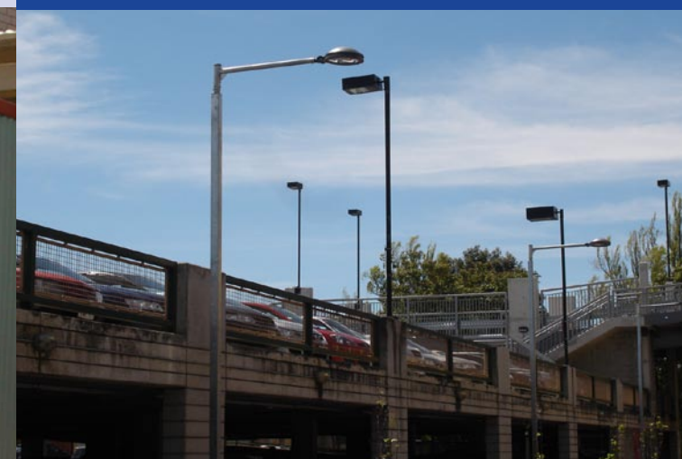
Caption re: Lighting