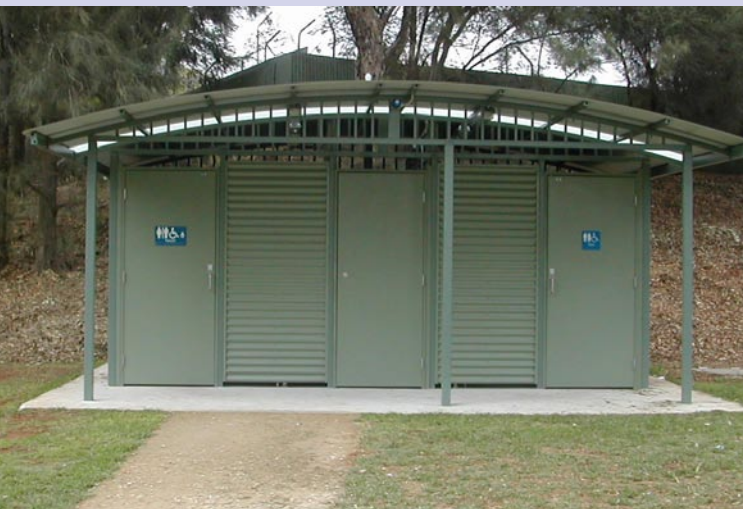
Caption re: Public Toilets?