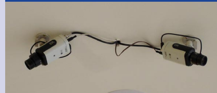
Caption re: CCTV