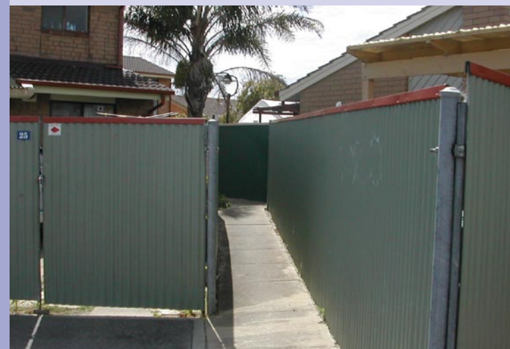
Caption re: Shared Property Design